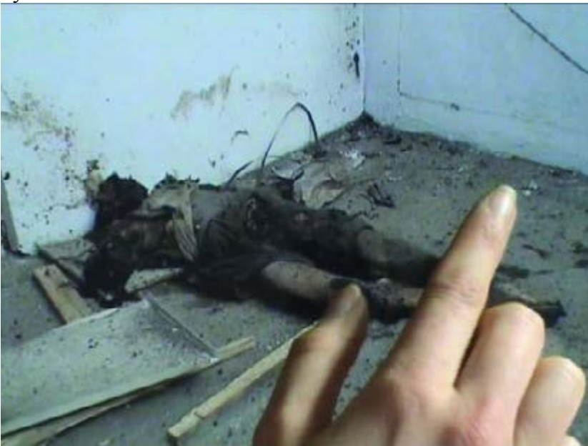
Thomas Hirschhorn: Touching Reality , 2012, still image of video, 4:45 minutes; courtesy of the artist and Galerie Chantal Crousel, Paris.